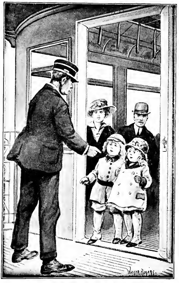
"WHERE ARE YOU YOUNGSTERS GOING?" The Bobbsey Twins in a Great City.